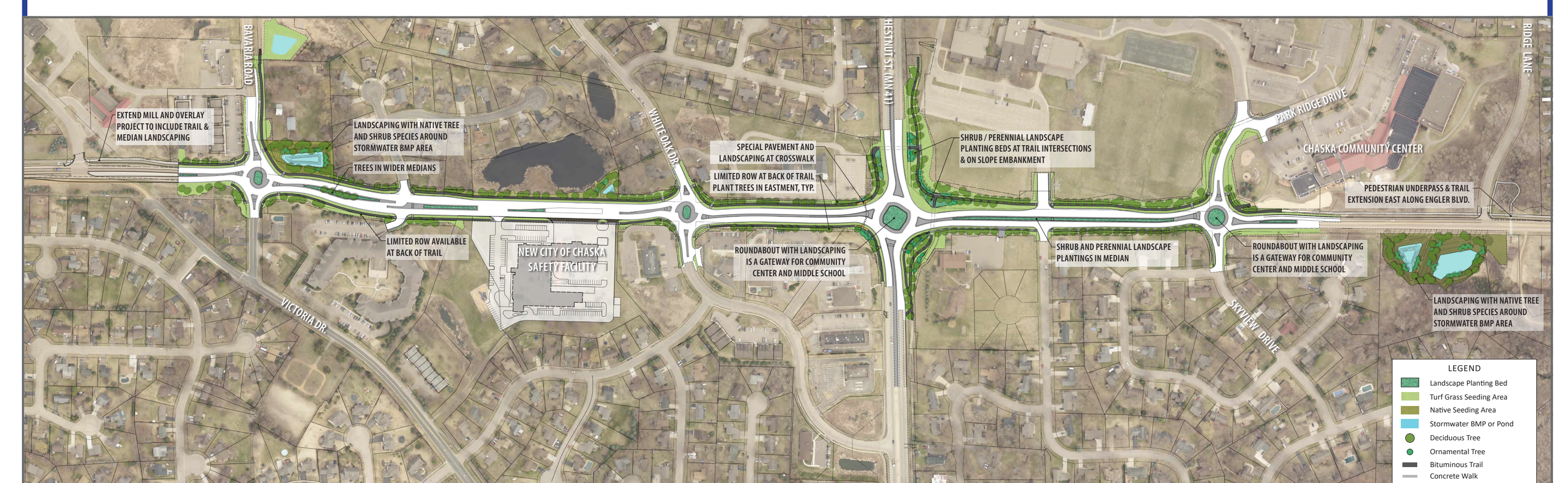
Areas in green represent landscaping opportunity areas once construction is completed. Plans are still in development.