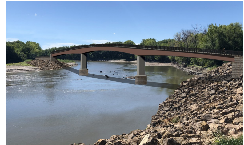
Rendering of future river crossing of the Merriam Junction Regional Trail