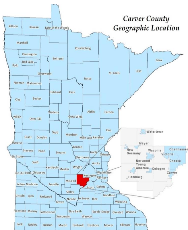
Figure 1: Carver County Location

and each year thereafter if statute remains unchanged. The amount designated to each county is based on the number of public water accesses as well as the number of watercraft trailer parking spaces within the county. Table 1 shows the prevention aid dollar amounts Carver County received each year since 2014. County efforts will be in addition to work conducted by the MN Department of Natural Resources. It is the hope that this legislation will, with federal, state, and local support, reduce the spread of aquatic invasive species and their detrimental effects on Minnesota's lakes and rivers.