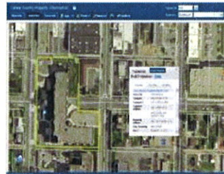
View larger image